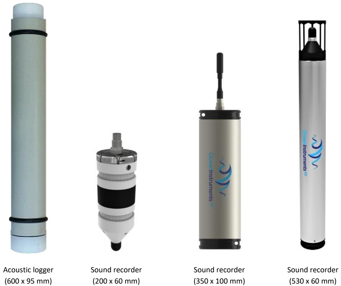
Figure S 2 Examples of equipment which the above moorings support.