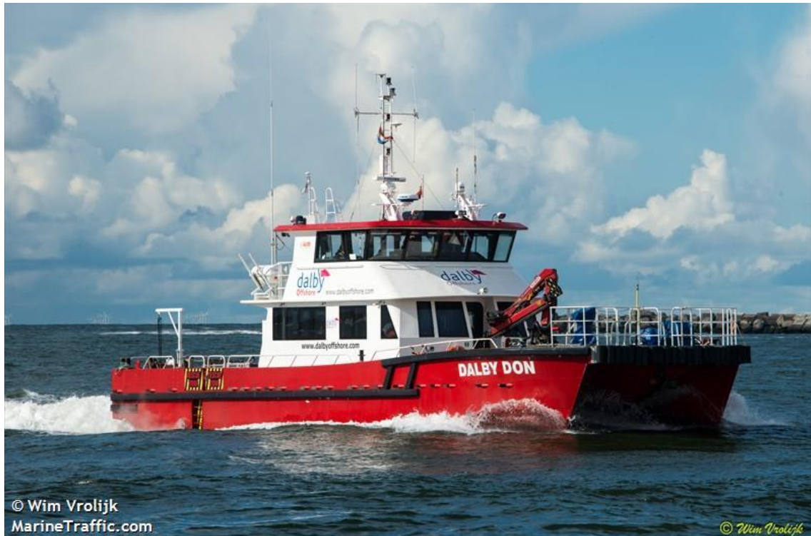
Figure 5. Dalby Don