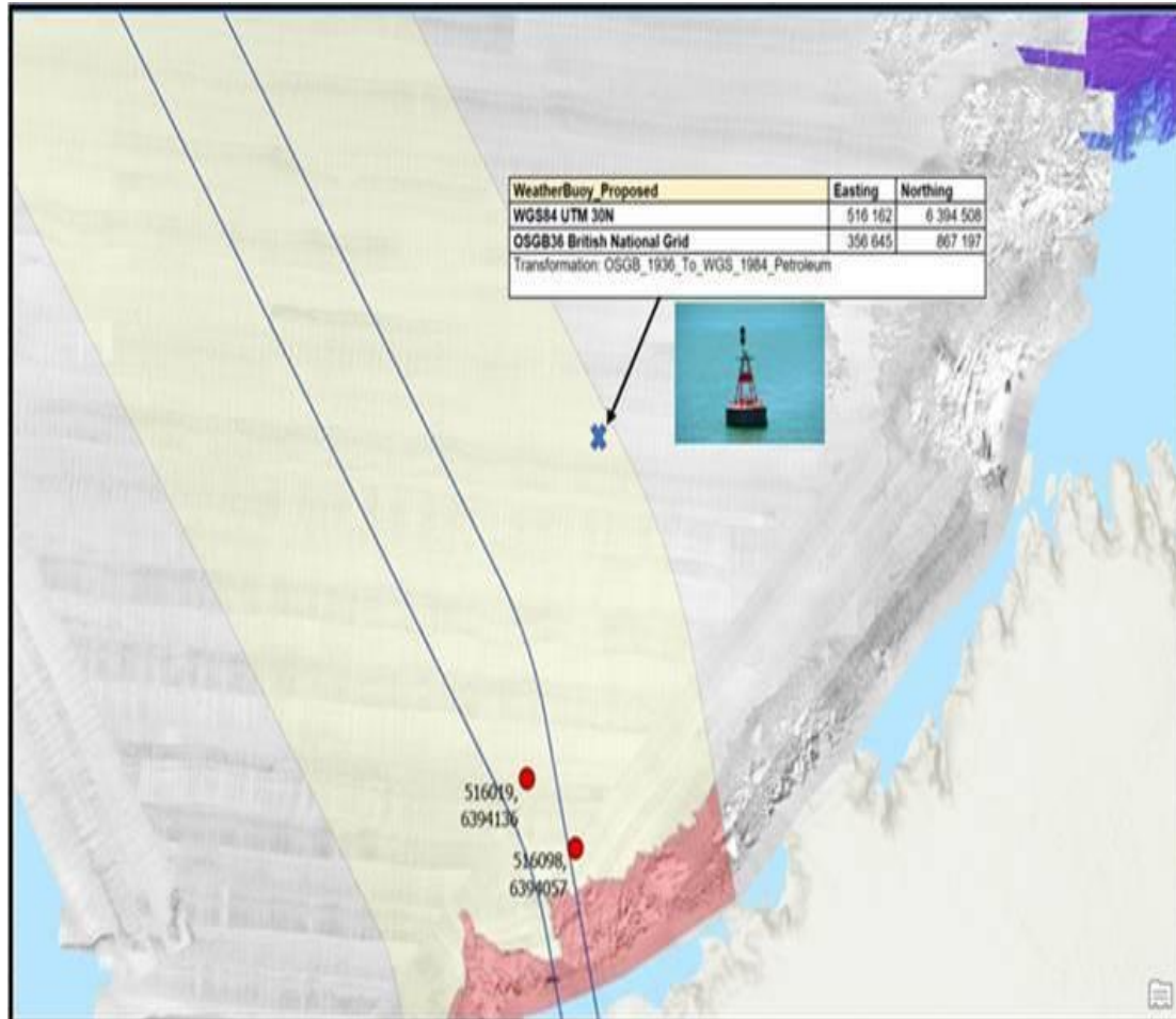
Figure 3. Weather Buoy – Zephyr Metocean buoy location and coordinates.

On completion of the HDD diving works, the weather buoy will be deployed by Isle of Jura in DP mode. The weather buoy details and proposed location/coordinates are provided below.