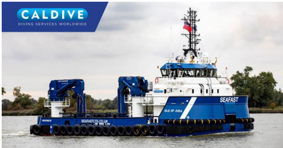
Figure 4. Isle of Jura

The diving vessel Isle of Jura will be supported by Dalby Don as the crew transfer vessel.