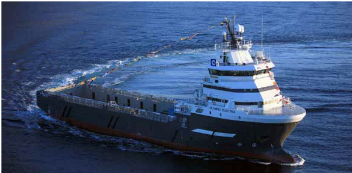
Figure 2. Olympic Electra – photo of the vessel