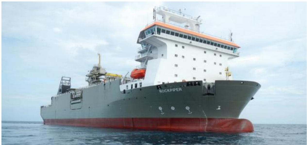
Figure 3. Rockpiper