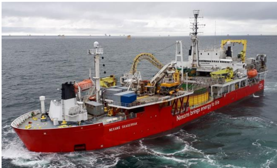
Figure 2. PLGR Vessel ‘C/S Nexans Skagerrak’