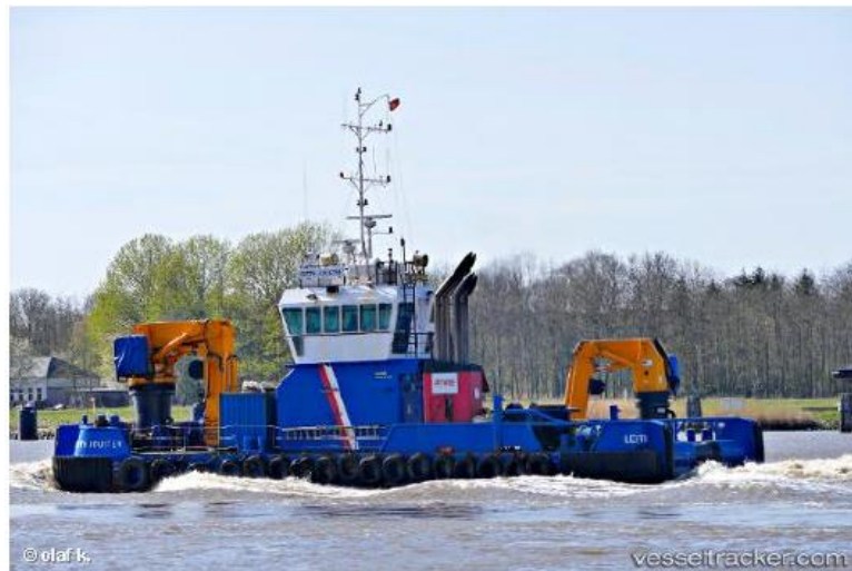
Figure 3. Forth Jouster