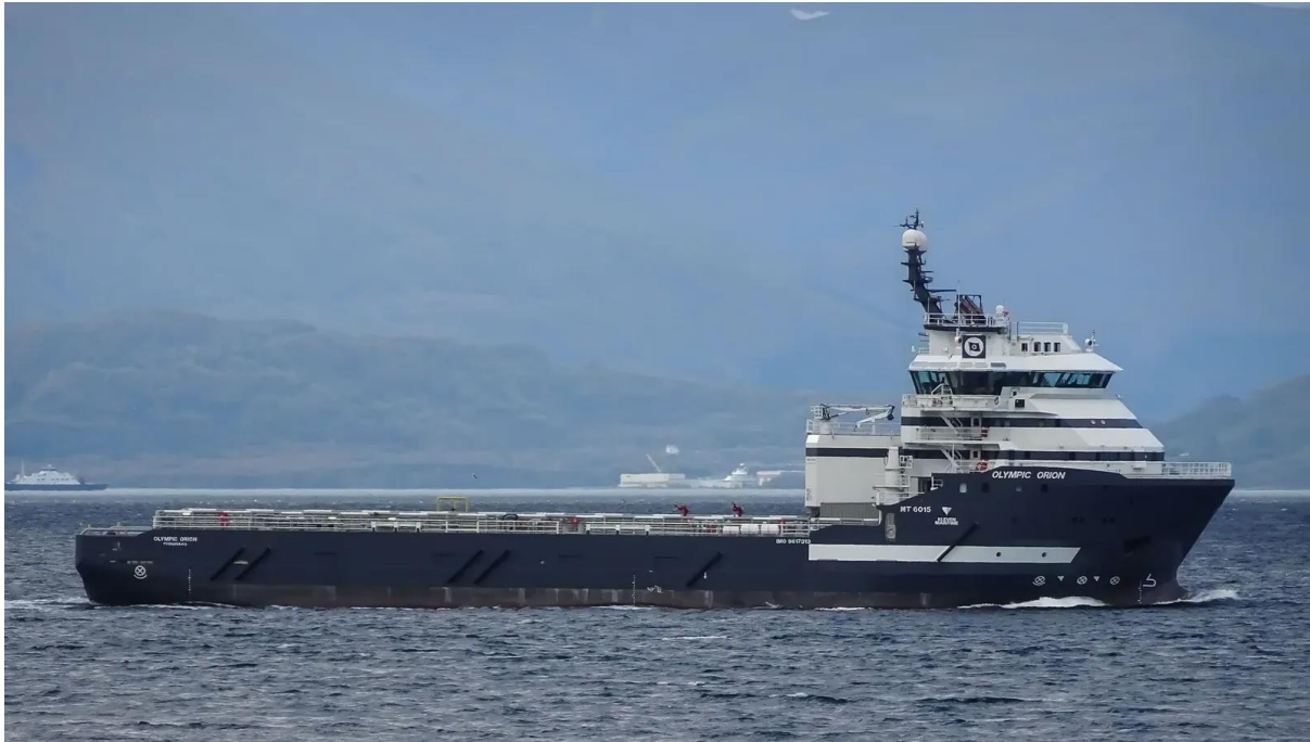
Figure 3. Olympic Orion – photo of the vessel