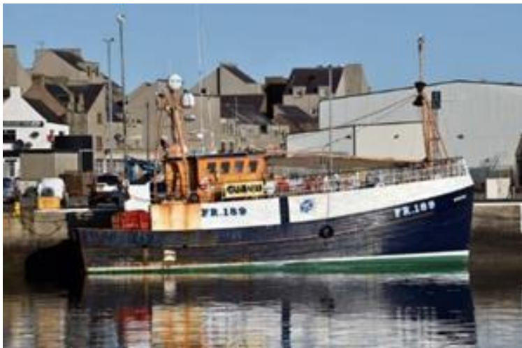
Figure 6. GV Bountiful