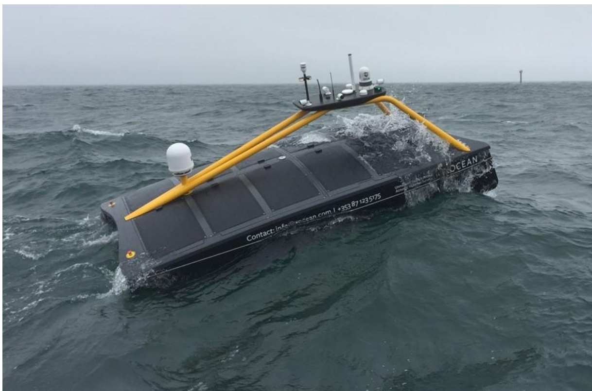
Figure 2: X-19