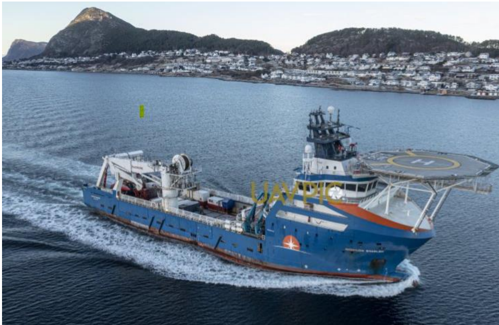
Figure 2. North Sea Enabler – photo of the vessel (Formerly Horizon Enabler)