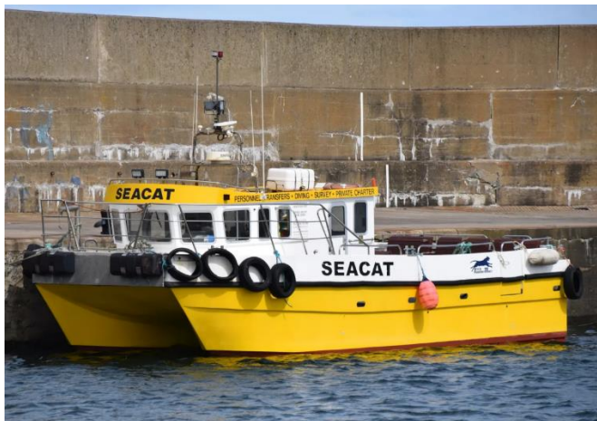
Figure 3 : Seacat Support Vessel