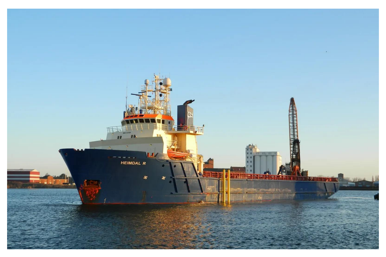
Table 2. Heimdal R – Vessel Details

Figure 2. Heimdal R – photo of the vessel