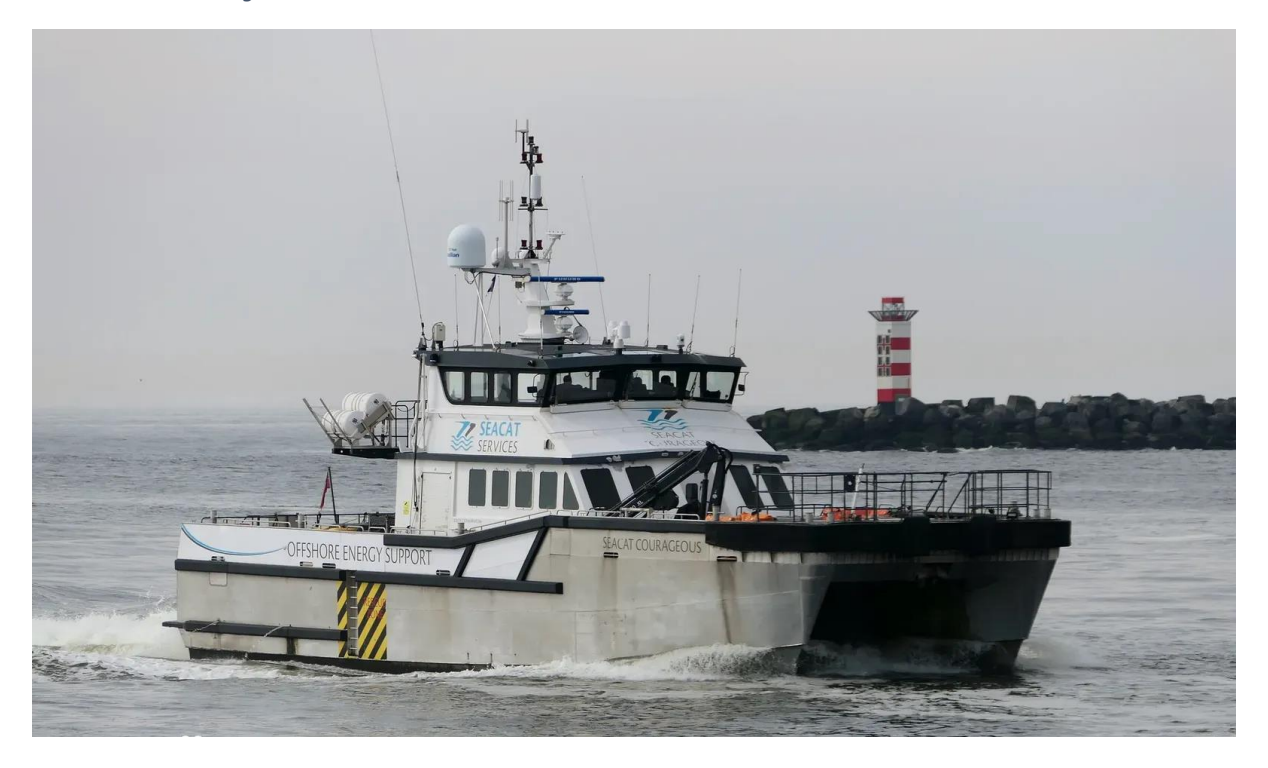
Figure 2. Seacat Courageous – photo of the vessel