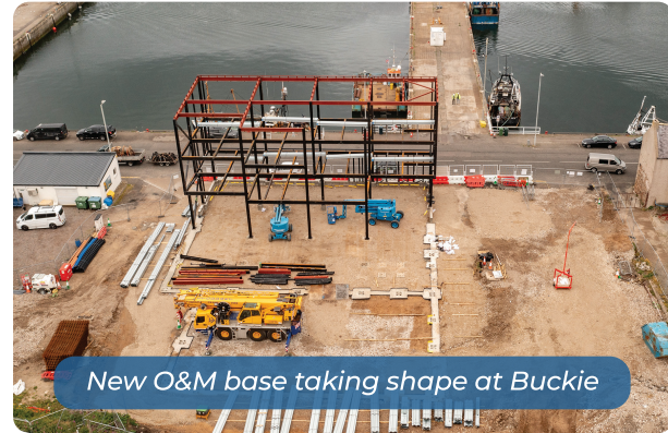
New O&M base taking shape at Buckie

Since our last newsletter in Spring 2023, work has continued at pace across all aspects of the full project. The project is on track to commence installation of the offshore components in September 2023, and generate first power from mid 2024.