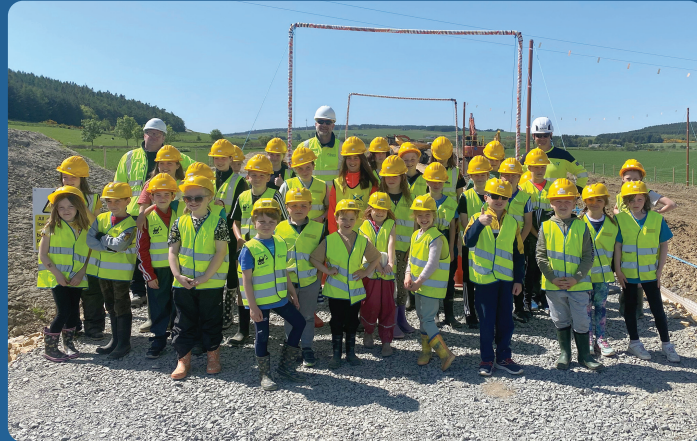
Above: Fordyce Primary School having a tour of a nearby construction site from the Cables Team at Moray West.

A highlight for Fordyce Primary School and the cables team was the site visit by the entire school to the nearby construction works. Our team also participated in a major STEM event in Aberdeen that brought together school pupils from across the whole North East with speakers, developers, agencies and the supply chain to learn about career opportunities in the offshore wind sector.