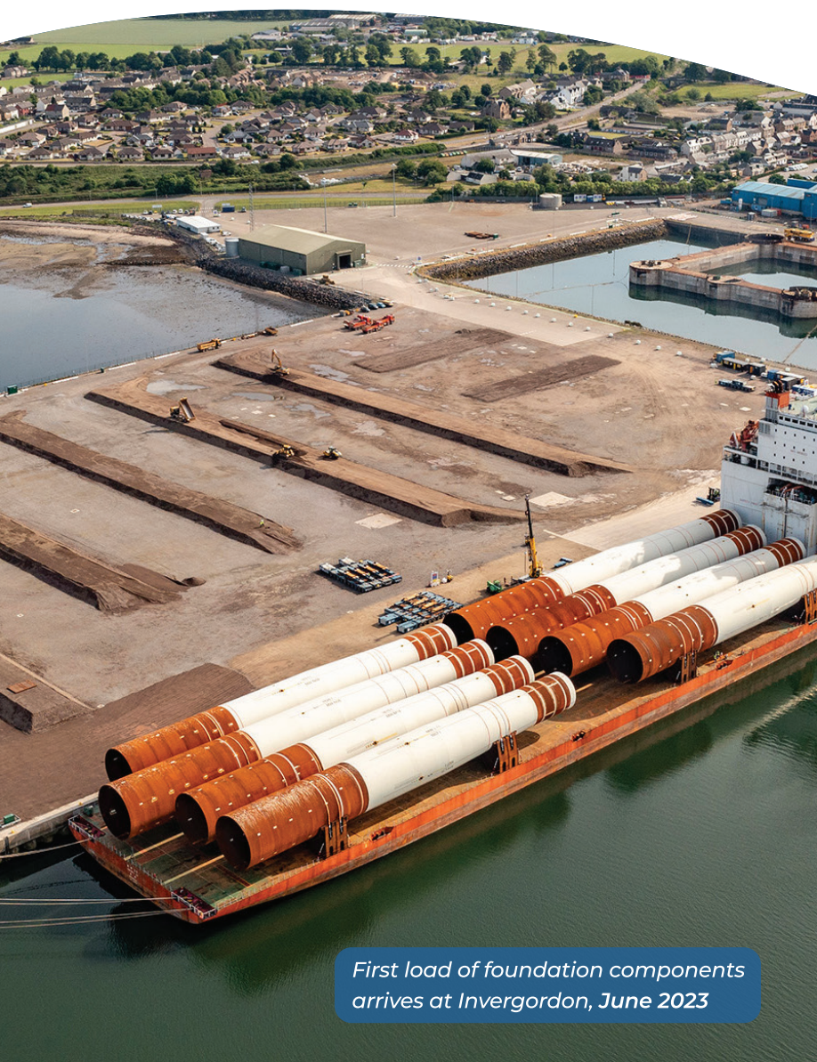
First load of foundation components arrives at Invergordon, June 2023