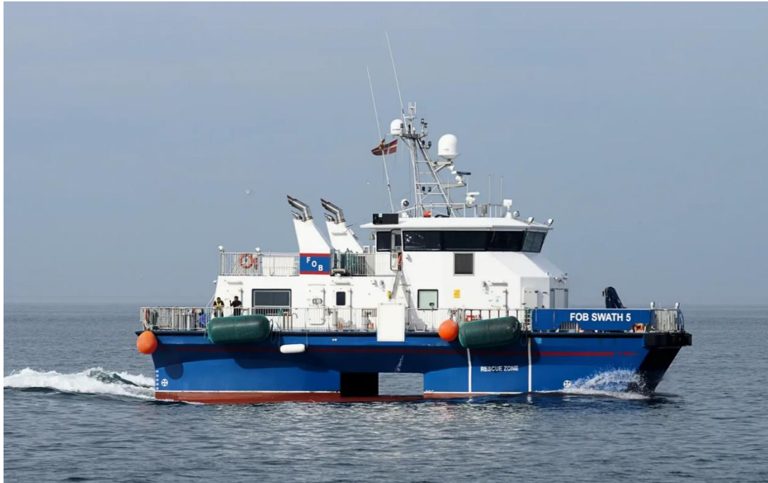
Figure 4: Fob Swath 5