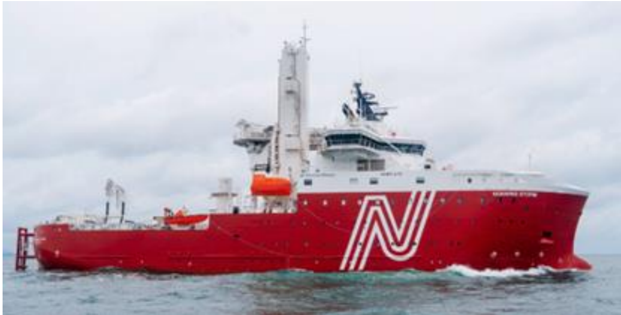
Figure 3: Norwind Storm