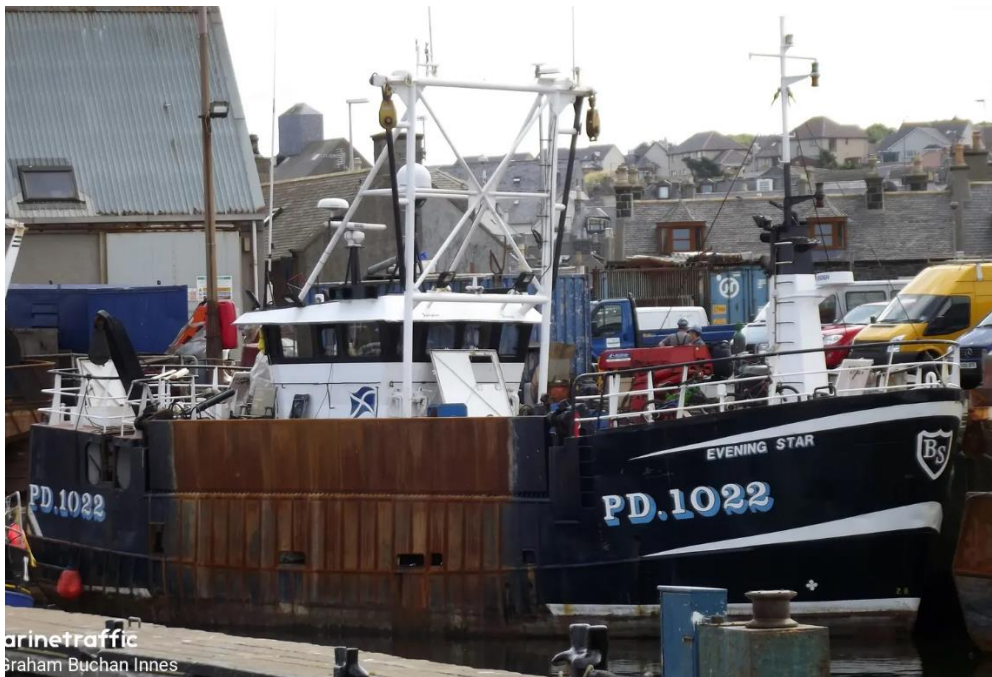
Figure 3: Evening Star – Photo of the vessel