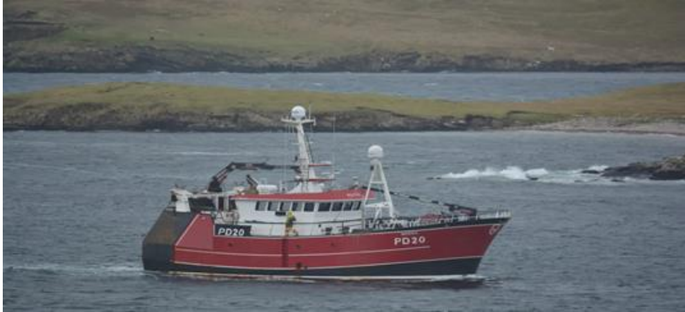
Figure 2: Westro – Photo of the vessel