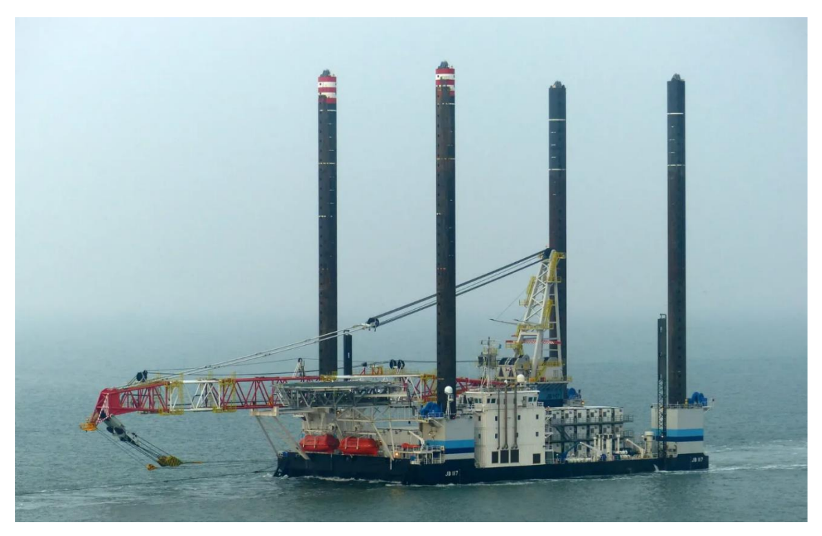
Figure 3 – JB 117