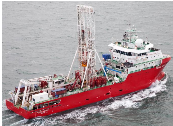
Figure 2. Fugro Scout